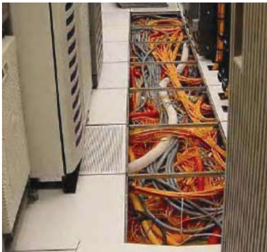
Figure 1. Disorganized cable management under floor tiles can impede cooling to equipment.

Other factors can influence system performance, such as moving or changing computer equipment without considering the underlying support strategies. Obstructions such as abandoned cabling can reduce air flow for cooling systems, as shown in Figure 1. Even new facilities can experience nagging cooling problems that create continuity risks or interfere with facility performance.