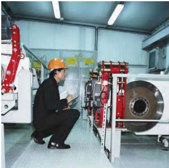
Figure 3. An electrical assessment can evaluate the integrity of a facility's power system to maximize availability of mission-critical infrastructure.

The electrical assessment is a critical part of the overall data center assessment since businesses have a 30 percent probability of experiencing power quality problems if their facility is more than five years old and has undergone significant changes. Evaluating the electrical system onsite, as seen in Figure 3, will help determine whether it is adequate for the data center now and in the future. Analyzing the integrity of the facility's power system will also help maximize availability of the mission-critical infrastructure.